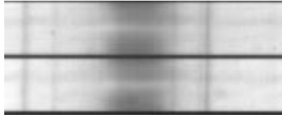
Figure 3. The image of the moustaches, H_{\alpha} line. The frame was acquired with a CCD detector.