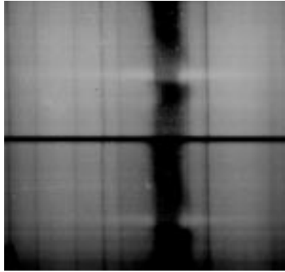
Figure 1. The image of the moustaches in the H_\alpha line. This frame was acquired using the photographic camera with 35-mm film.

to use the characteristic curve for the film and at the same time we should take account of the transfer function of the CCD (used as the digitizer) and the uniformity of light in the microphotometer. This is very important for future accurate analysis of real solar data. Also at this stage we carry out procedures which are specific to every frame, removing errors (e.g., dust or cuts on film), trends and disturbances from the photographic image. After that we can use the digitized image from photographic plate or film as input for astrophysical investigation.